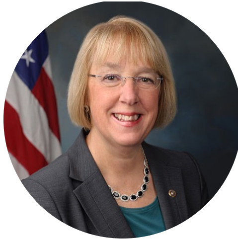
Patty Murray (WA)